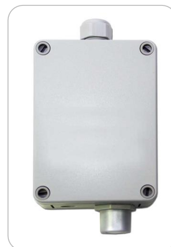
Option housing "A" with sensor unit in plastic housing