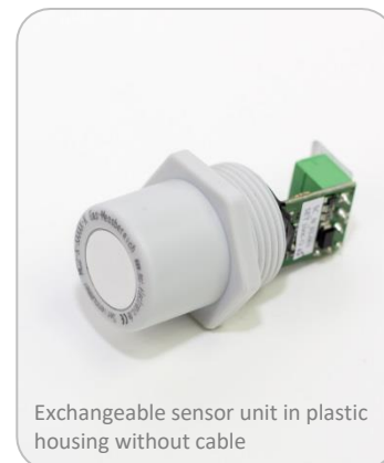
Exchangeable sensor unit in plastic housing without cable