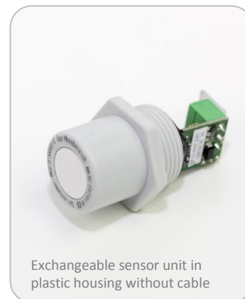
Exchangeable sensor unit in plastic housing without cable