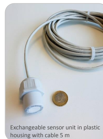
Exchangeable sensor unit in plastic housing with cable 5 m